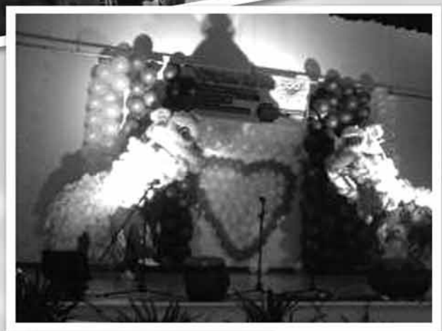
Lion Dance Performance

As if giving the party was not enough, when the party ended at about 11pm, SHAMANS donated the numerous potted plants which they had bought to decorate the stage area to HWA.