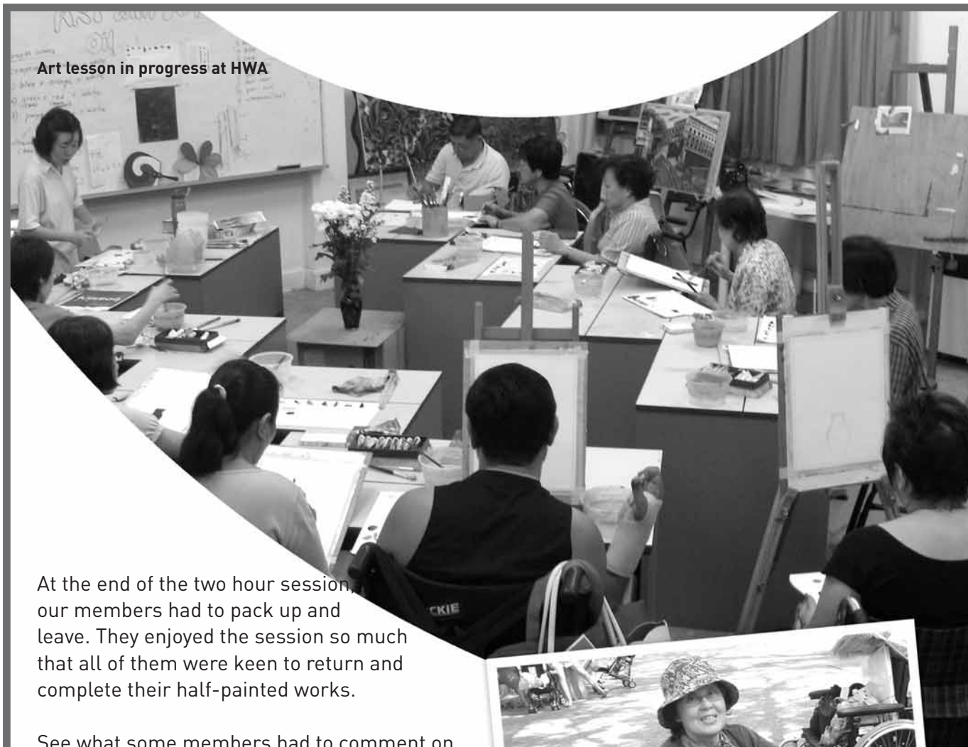
Art lesson in progress at HWA

At the end of the two hour session, our members had to pack up and leave. They enjoyed the session so much that all of them were keen to return and complete their half-painted works.