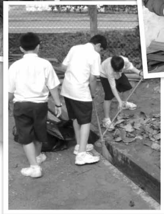
ACS(I) boys lend a helping hand by clearing dead leaves and sanding down wooden blocks for wheel- chokes.