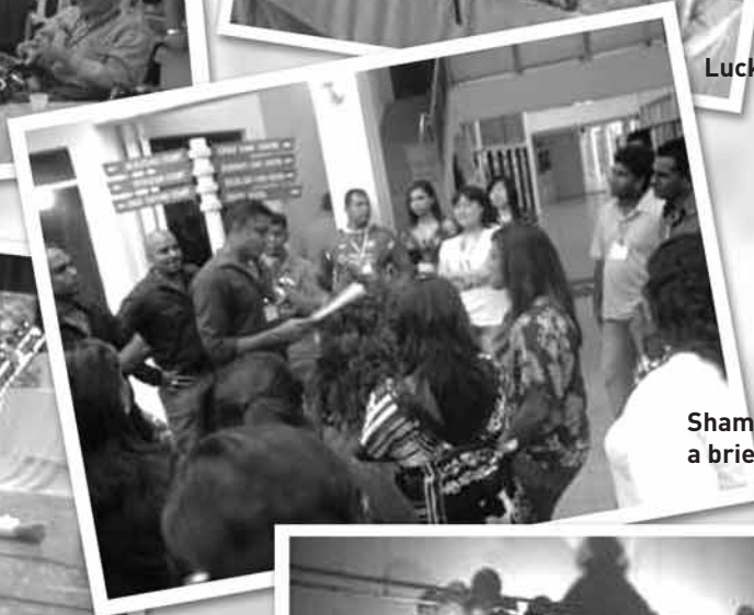
Shamans giving a briefing