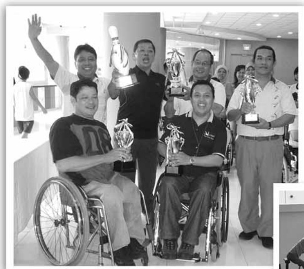
HWA members excelling in various sports – Bowling, Wheel Chair Basketball and Lawn Bowling

It will be Singapore's largest contingent to the Games.