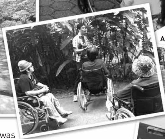
Art therapy at Botanic Gardens