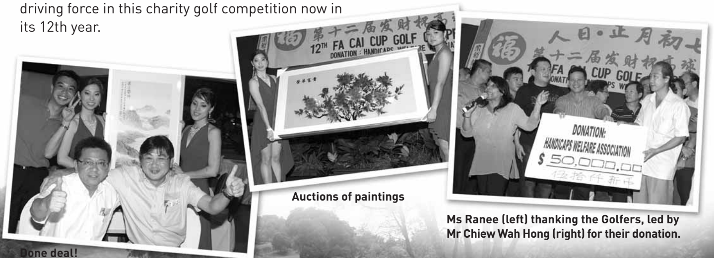
Auctions of paintings