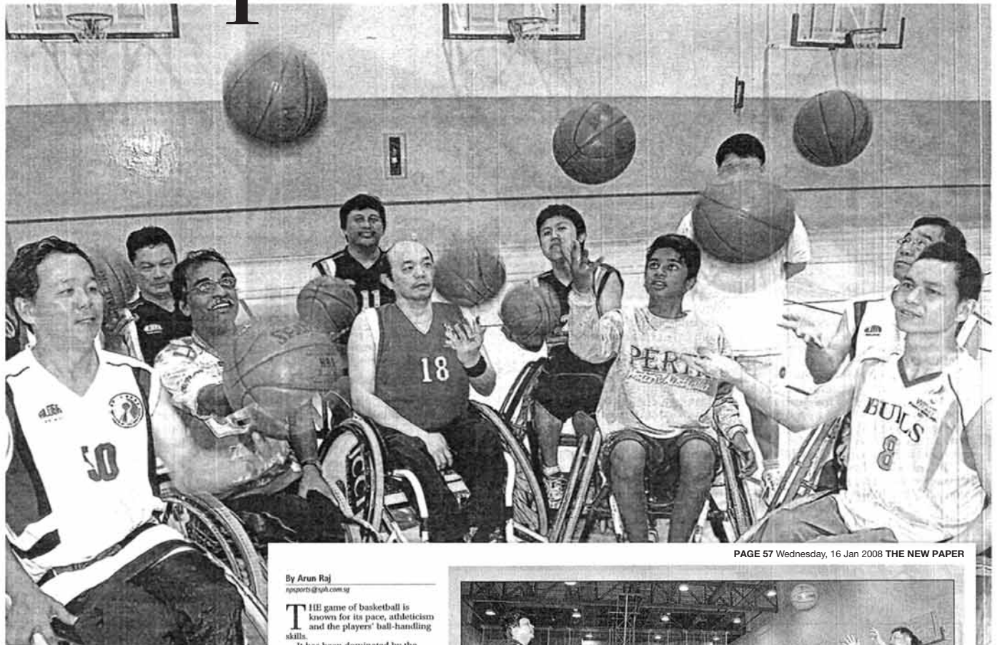
PAGE 57 Wednesday, 16 Jan 2008 THE NEW PAPER