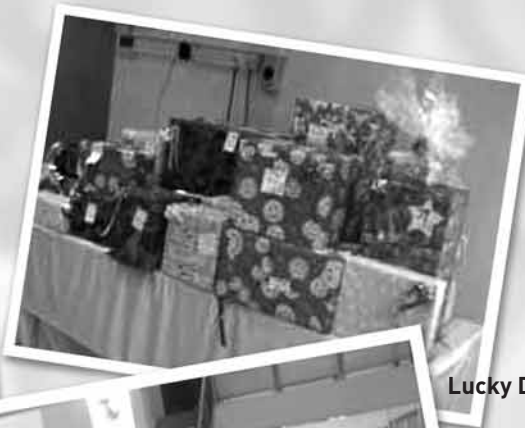
Lucky Draw Prizes