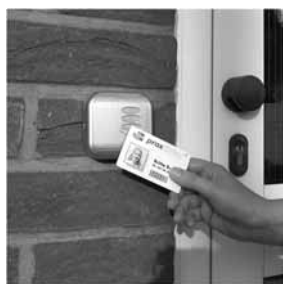
Contactless smartcard system for convenient door access