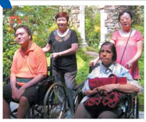
Members with Nparks volunteers