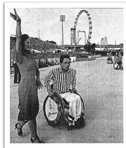
LIAN HE ZAO BAO 14 JULY 2008

This is the first time that wheelchair dancing is performed at National Day Parade. It was a very