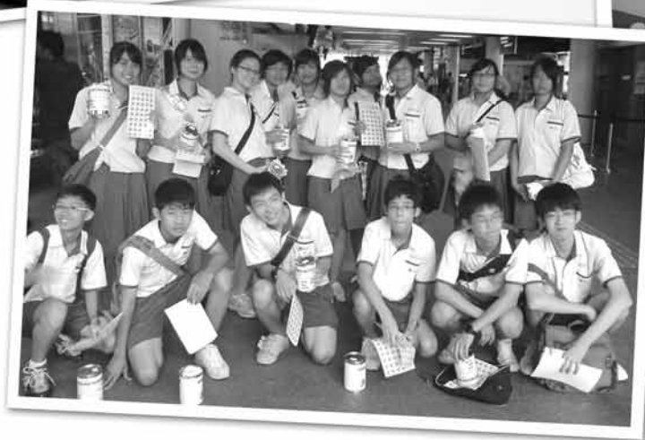
Students from Bukit View Secondary School.

to obtain the total amount collected. A total of 117 volunteers were present to help with the coin-counting process! Special thanks to the regular group of HWA volunteers who are not new to the coin-counting procedures. Our appreciation also goes out to the volunteers from Ministry of Manpower, Geylang West CC (Integration Club) and the Shaman's group.