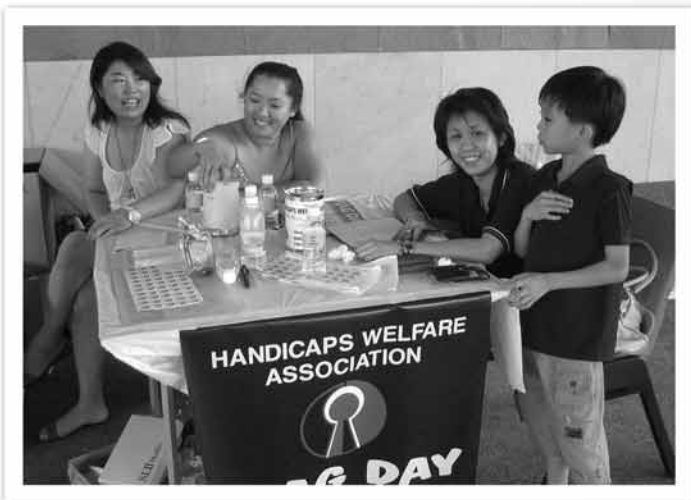
Our staff and volunteer at Woodlands station