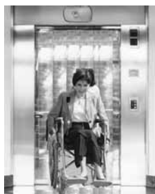
Totally handsfree door access with reading distance of up to 8m