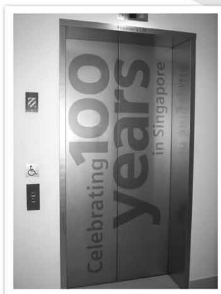
Lift for the Handicapped