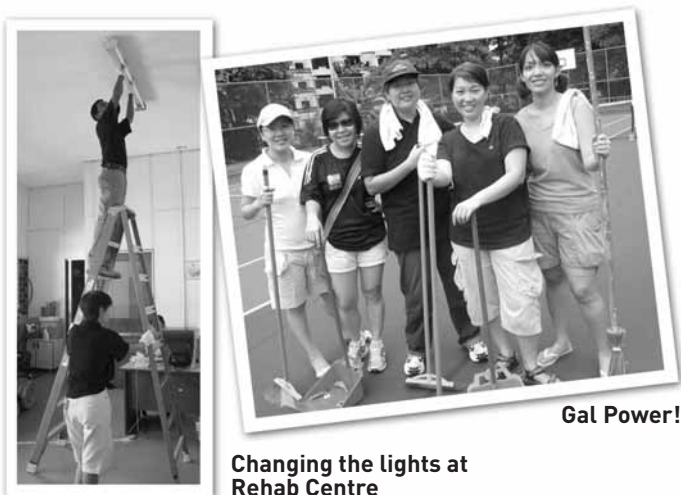
Changing the lights at Rehab Centre

"Community programs encourage engagement with the communities in which we interact, recognising our accountability for what we take, create and leave behind."