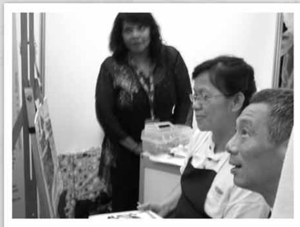
PM Lee visits HWA Booth

For 2 days, it was all about food, games and loads of fun. Minus the rain (which did nothing to dampen the spirit of the people at the Carnival), the event was a huge success which saw almost 20,000 people participating. Prime Minister Lee Hsien Loong also joined in the celebrations as