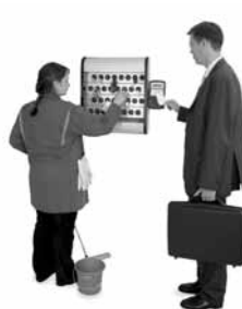
RFID electronic key management system