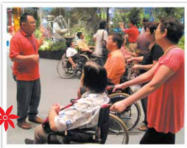
Our friendly tour guide leads the way

It was not a big group and most of the members turned up with their family members at the Festival which, to me, was very heart warming.