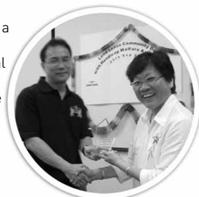
A token of appreciation to CEO of Lend Lease Investment Management, Mr Ooi Eng-Peng

Community Day is now a well established and much anticipated annual program, encouraging employees to participate in community activities where they can personally make a difference. Since 1996, Lend Lease employees have contributed over 400,000 volunteer hours across thousands of community projects around the world on Community Day. Community Day projects encompass a wide range of volunteer activities where employees can personally make a difference by contributing their time, energy, enthusiasm and skills.