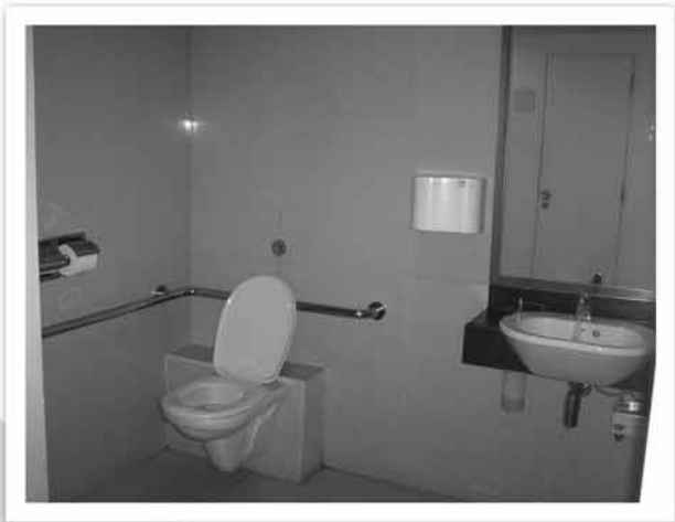
Toilet for the Handicapped

“Excellent! The toilet is as good as a hotel’s, and I have no problems with accessibility at all.”