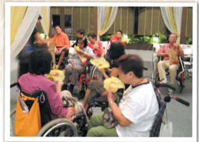
It's lunch time!

with the rest of the group. That's how much our members enjoyed the trip.