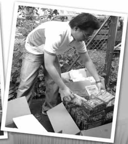
Our Friends from Siemens