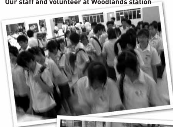
Zhong Hua students queing up for tins