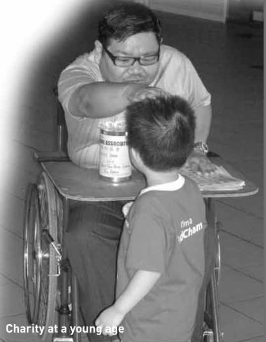
Charity at a young age